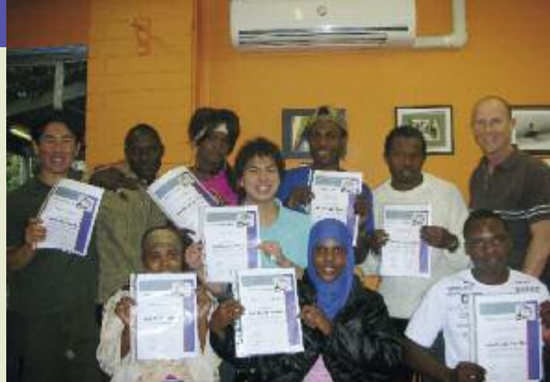
Participants from the August group at the completion of the course