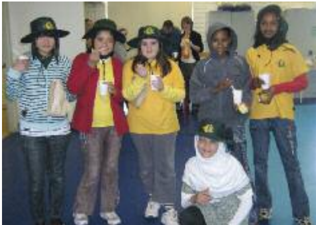
Students participating in the Harmony Project

For more information on the Living in Harmony programme, visit www.harmony.gov.au